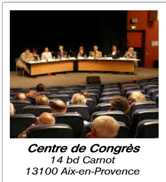
Centre de Congrès 14 bd Carnot 13100 Aix-en-Provence