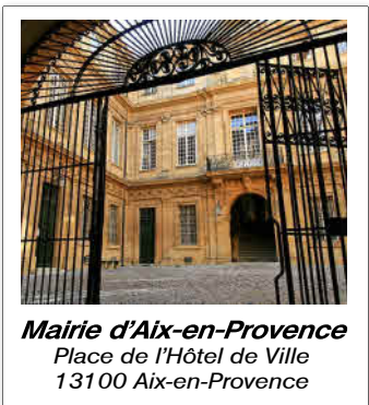
Mairie d'Aix-en-Provence Place de l'Hôtel de Ville 13100 Aix-en-Provence