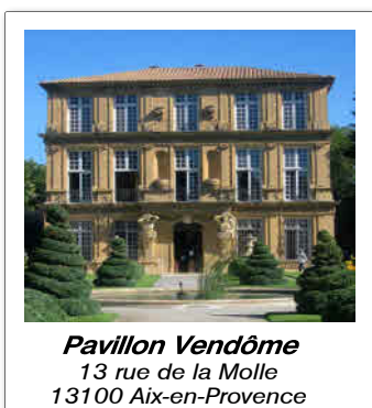
Pavillon Vendôme 13 rue de la Molle 13100 Aix-en-Provence