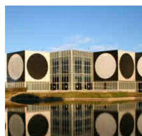
Fondation Vasarely 1, Avenue Marcel Pagnol 13090 Aix-en-Provence