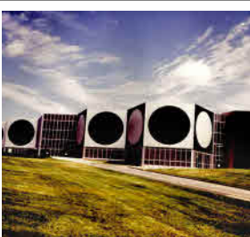
Fondation Vasarely 1, Avenue Marcel Pagnol 13090 Aix-en-Provence

07:30 pm ► Gala dinner * * Dress code : Black tie & evening dress