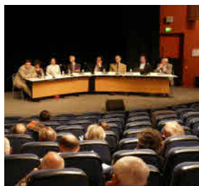
Centre de Congrès 14 bd Carnot 13100 Aix-en-Provence