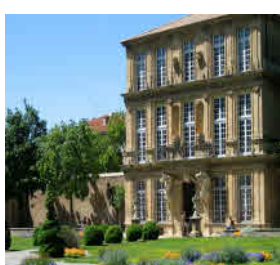
Pavillon Vendôme 13 rue de la Molle 13100 Aix-en-Provence