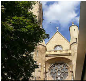
Musée Granet Place St Jean de Malte 13100 Aix-en-Provence