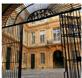
Mairie d'Aix-en-Provence Place de l'Hôtel de Ville 13100 Aix-en-Provence