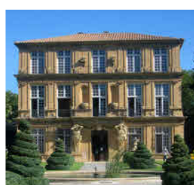
Pavillon Vendôme 13 rue de la Molle 13100 Aix-en-Provence