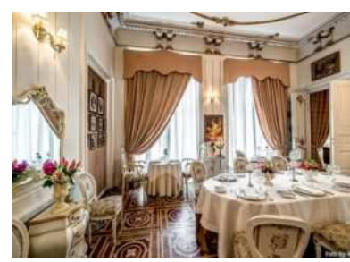
al. Ujazdowskie 24