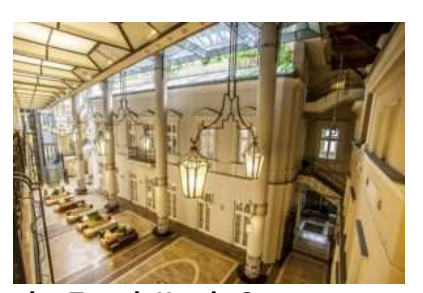
plac Trzech Krzyży 3