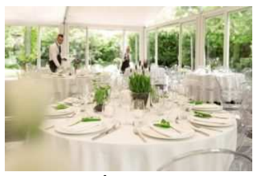
ul. Foksal 3/5

"Villa Foksal" restaurant (dress code – black tie)