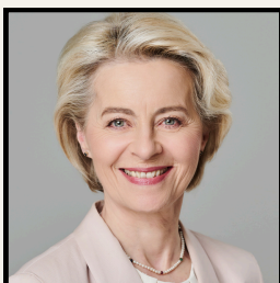
Ursula Von der Leyen President of the European Commission (2019-present)

Visitors can enjoy information sessions held at the Visitors' Center as well as the "Experience Europe" interactive exhibit, which provides groups with tailored presentations on policy. Bookings should be made at least 10 weeks in advance for larger groups, and the institution can be found at the direction of Charlemagne building, Rue de la Loi 170 1040 Brussels Belgium. Visitors wishing to make a reservation should contact the European Commission through their email, listed on the visitor's page within their website.