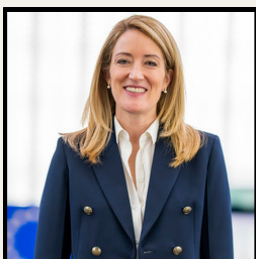
Roberta Metsola, President of the European Parliament (2022-present)

The individual and group visits offered at the Brussels location include access to the Parliamentarium, the Hemicycle, House of European History, Esplanade Solidarność 1980, Info Hub, Europa Building, and Citizen's Garden. The official address of the Parliament building is located in the heart of the European Quarter at 60 Rue Wiertz / Wiertzstraat 60, B-1047 Bruxelles/Brussels . The most efficient way to arrange a visit is to use the Parliament's visitor portal, found at https://visiting.europarl.europa.eu/en . This can also be accomplished by contacting the Visitor Service's email and phone.