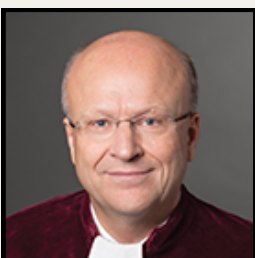
Koen Lenaerts President of the Court of Justice of the European Union (2015-present)

Free visits to the CJEU often include a number of presentations about the court and its work and, if possible, attendance at a court hearing. Visitors are allowed access to the institution on workdays between the hours of 8:00 and 17:30. The address is Palais de la Cour de Justice Boulevard Konrad Adenauer 2925 Luxembourg . To make an appointment, visitors must submit a visit application at least two weeks before the anticipated date through the CJEU visitor's website.