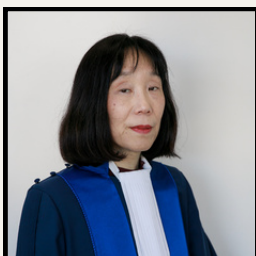
Tomoko Akane President of the International Criminal Court (2018-present)

Visits to the Court's headquarters and to court hearings are generally free to the public and allowed without reservation, however, guided visits should be arranged for a more comprehensive tour of the institution. Tailored working visits can be arranged for groups of civil society representatives such as state representatives, delegations of lawyers, and other stakeholders. The ICC is located at Oude Waalsdorperweg 10, 2597 AK, The Hague, The Netherlands . Such reservations can be arranged through the registration link within the institution's visitor information page .