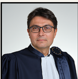
Mattias Guyomar President of the European Court of Human Rights (2025-present)

Information sessions are open to legal professionals, and usually include the screening of a documentary followed by a presentation of the roles and functions of the court. The direction of the court is All. des Droits de l'Homme, 67000 Strasbourg, France . It is recommended that groups submit their application to visit two months in advance through the visit application found online.